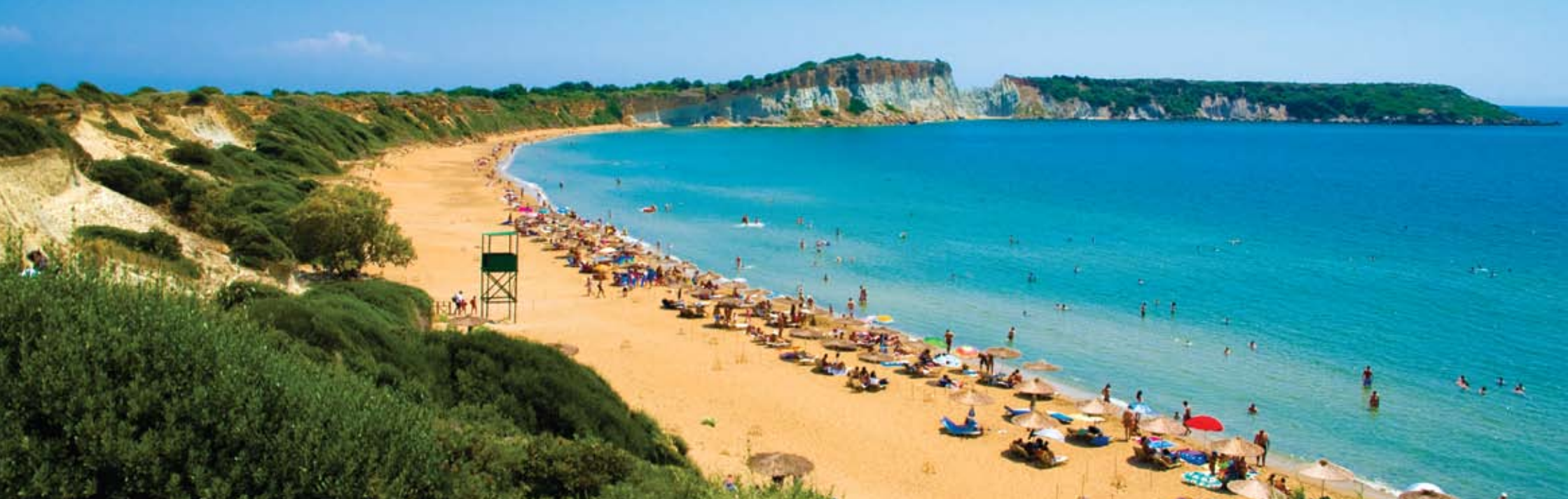
The Gerakas Peninsula has been designated as the first protected Marine Park in the whole of the Mediterranean, as it is one of the last nesting sites of the Loggerhead Sea Turtle, Caretta Caretta.