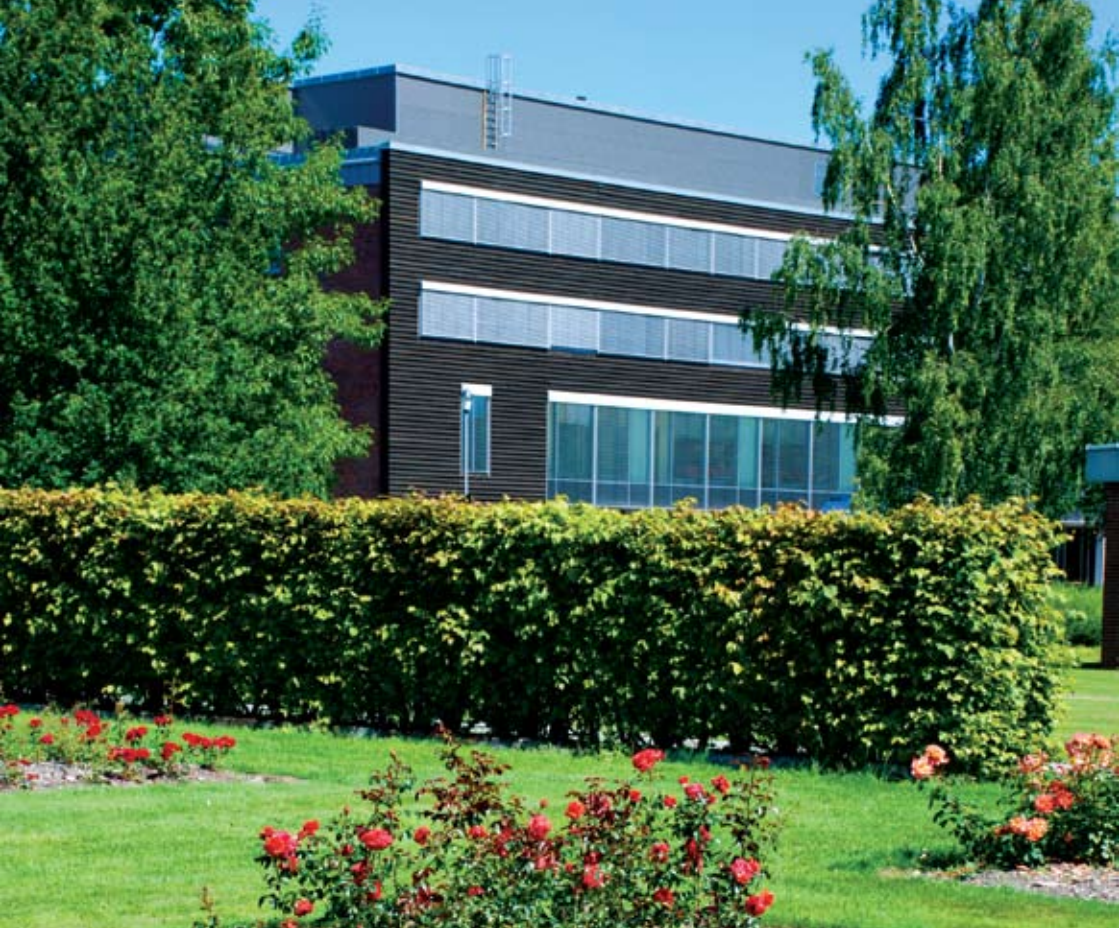
Norwegian University of Life Sciences with Jets™ sanitary system.