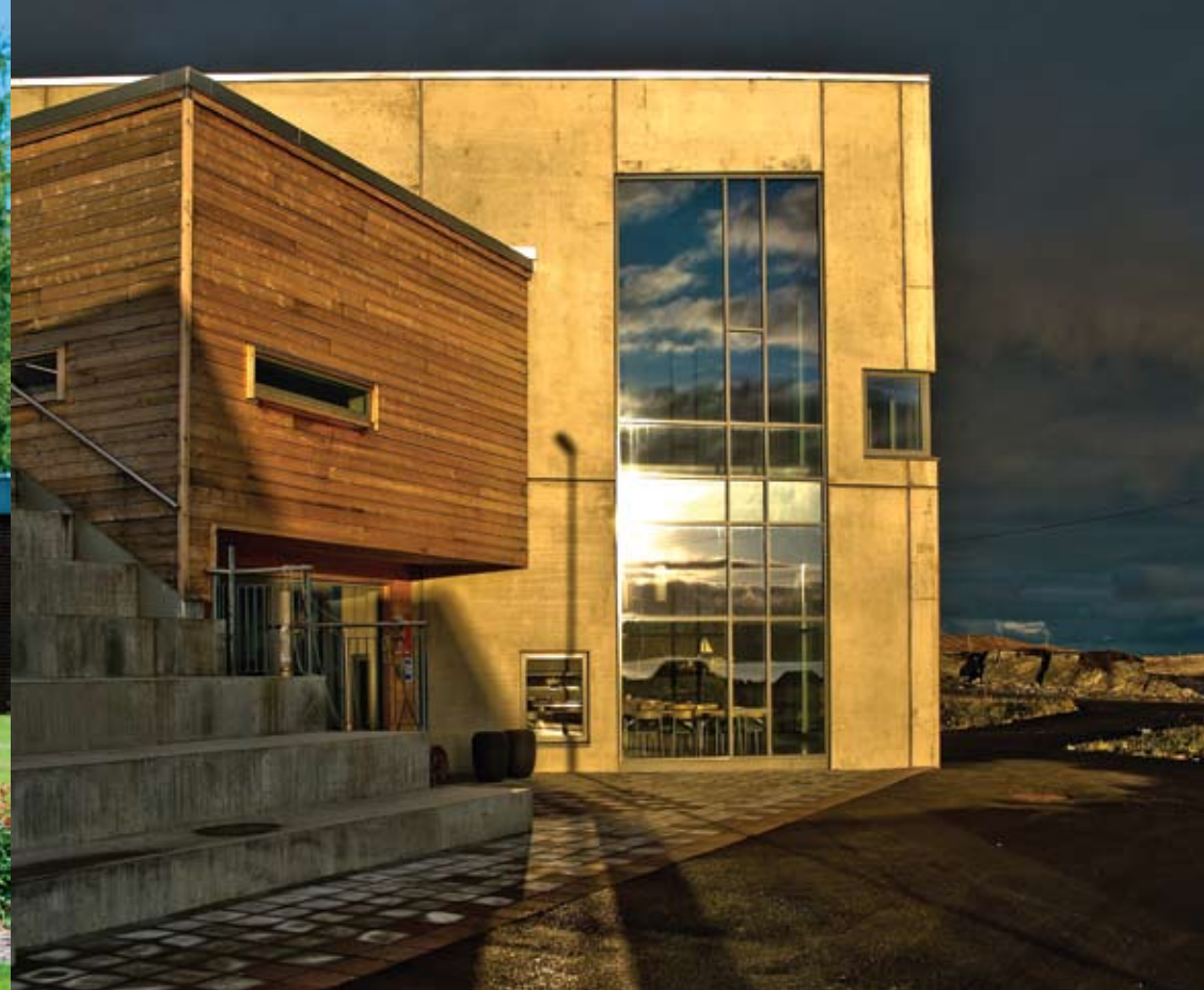
Runde Environmental Centre, Norway, with Jets™ sanitary system.

One of the Institute (Sørhellinga) (below) has been designed to the standards of 'green' technology, including sustainable building materials, energy efficiency and integrated water and organic waste management.